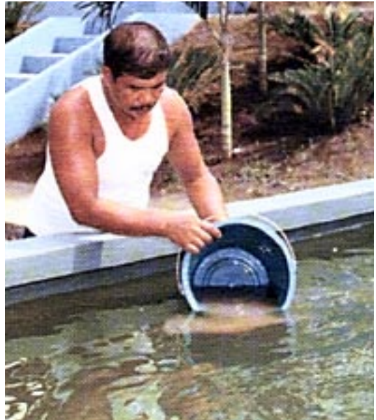
From two days after hatching until harvest, milkfish larvae are fed with rotifers cultured with a diet of the green algae, Chlorella sp. Artificial larval diets formulated by SEAFDEC AQD are also given as supplement.