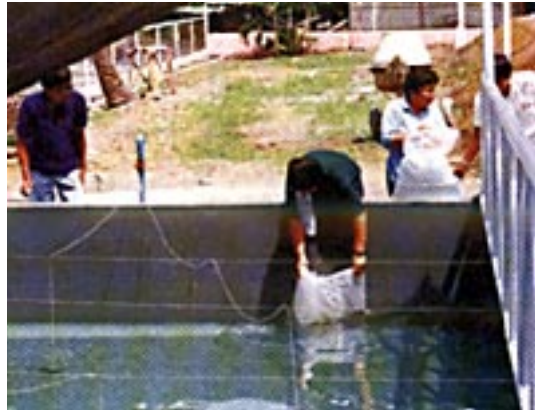
Milkfish larvae are reared in concrete tanks of 1m depth provided with filtered seawater and aeration.

With the consistent supply of eggs from captive breeders, hatchery fry production technology was gradually generated. This technology has been verified for its biotechnical and economic feasibility. Fry from the hatchery has been raised by several fishfarmers in Iloilo, Negros Occidental and Guimaras provinces. Pond production using hatchery-produced fry was similar to that of wild fry.