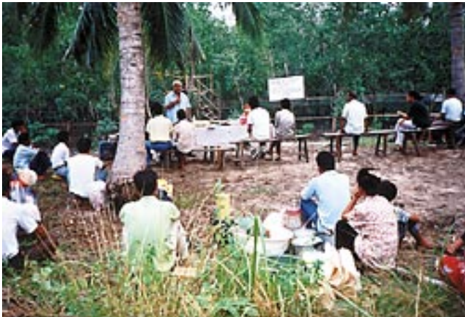
The president of Manalo Multi-Purpose Cooperative briefing the members about the aquasilviculture project at Brgy. Manalo, Honda Bay, Puerto Princesa, Palawan