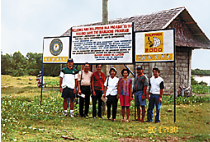
The mudcrab pens in Buswang, Kalibo, Aklan were jointly established by SEAFDEC and KASAMA, a local people's organization.

The provision of resources or goods from both forest and fishery is the most well-known function of mangroves. Fisheries products include fish, shrimp, crabs, molluscs, and other invertebrates. The forest yields charcoal, firewood, timber, fishing poles, fodder, honey, etc. The estimated value of all these mangrove goods and services can be as high as US$10,000 per ha per year.