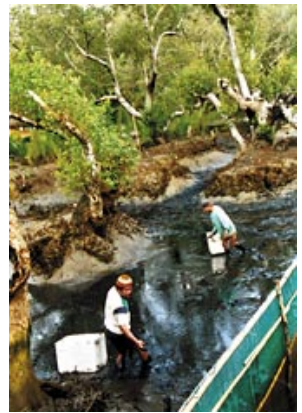
Net enclosure pond for shrimp and mud crab culture in Aklan