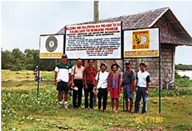
The mudcrab pens in Buswang, Kalibo, Aklan were jointly established by SEAFDEC and KASAMA, a local people's organization.

The provision of resources or goods from both forest and fishery is the most well-known function of mangroves. Fisheries products include fish, shrimp, crabs, molluscs, and other invertebrates. The forest yields charcoal, firewood, timber, fishing poles, fodder, honey, etc. The estimated value of all these mangrove goods and services can be as high as US$10,000 per ha per year.