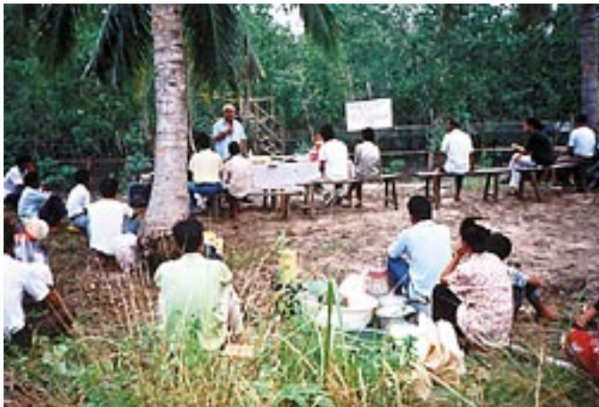
The president of Manalo Multi-Purpose Cooperative briefing the members about the aquasilviculture project at Brgy. Manalo, Honda Bay, Puerto Princesa, Palawan