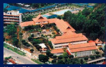
Marine Fishery Resources Development and Management Department (MFRDMD) in Kuala Terengganu, Malaysia (1992) for the development and management of fishery resources in the exclusive economic zones of member countries