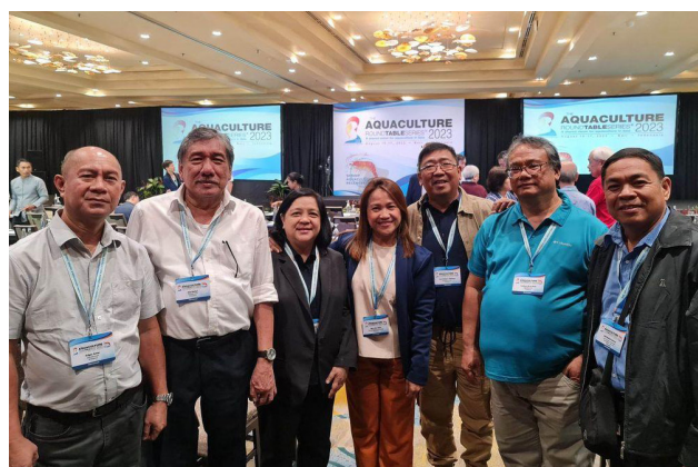
SEAFDEC/AQD's Executive Committee members take a pose with their fellow delegates.