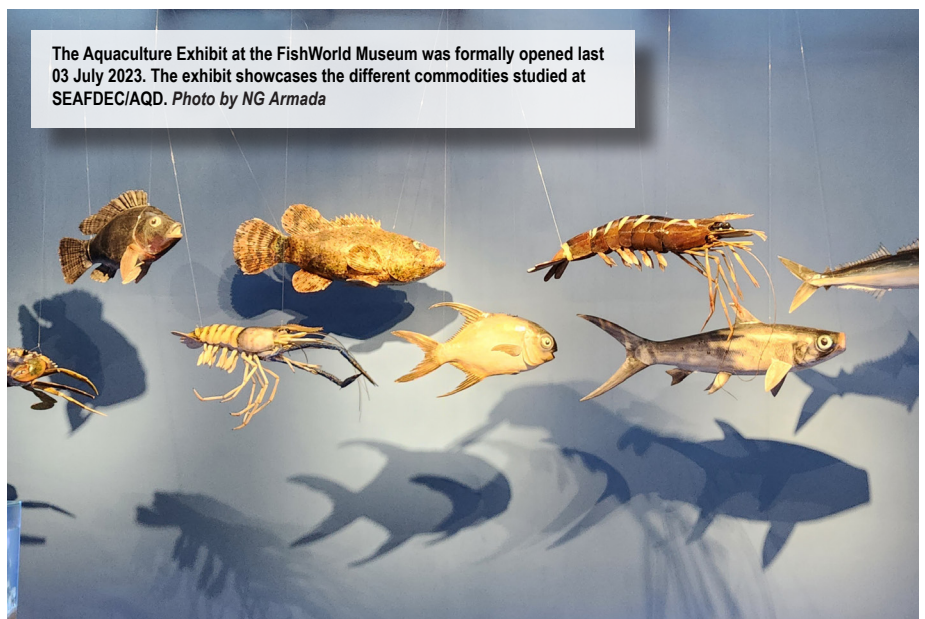
The Aquaculture Exhibit at the FishWorld Museum was formally opened last 03 July 2023. The exhibit showcases the different commodities studied at SEAFDEC/AQD.