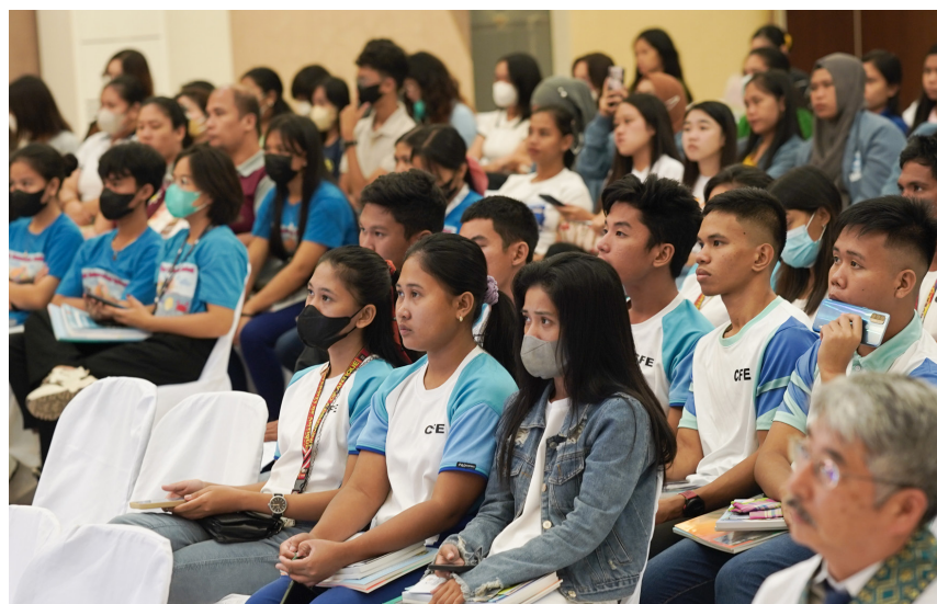
An aquaculture research talk was held on 6 July 2023, drawing hundreds of students and faculty members from various high schools and institutions in Panay and Mindanao.