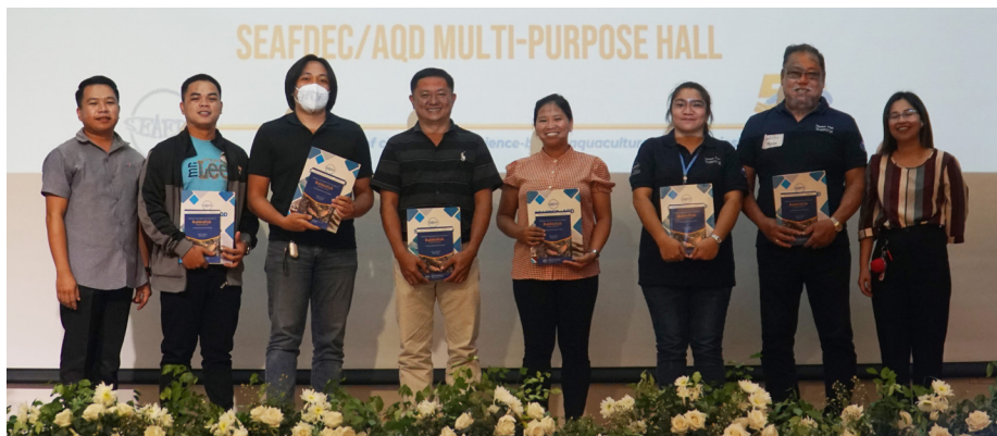
Attendees of the book launching event receive free aquaculture extension manuals from SEAFDEC/AQD.

SIX new aquaculture extension manuals penned by SEAFDEC/AQD's scientist, experts, and researchers were introduced and distributed during the institution's 30th Book Launching on 4 July 2023 in Tigbauan, Iloilo.