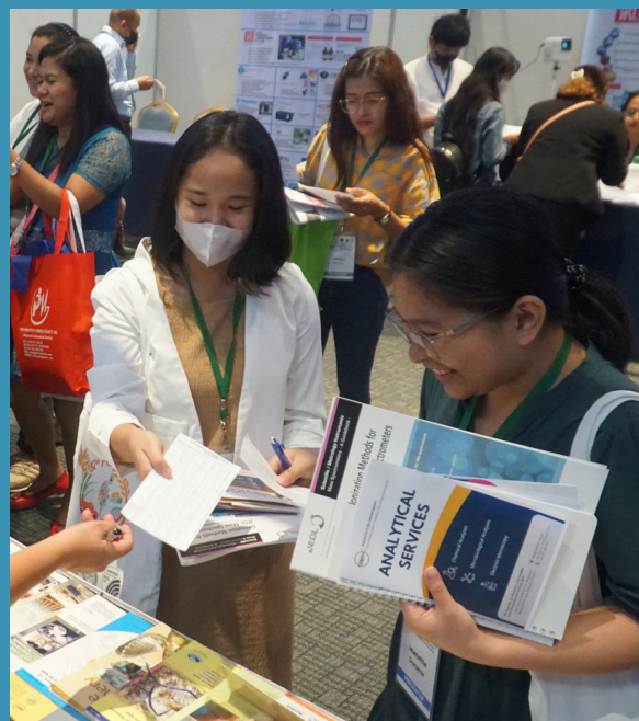
Upon visiting the booth, exhibit participants receive flyers and free information materials from SEAFDEC/AQD.

This year's theme, "Chemistry and Agriculture 4.0: Chemistry for Agriculture and Food Security," highlights the importance of chemistry in raising the level of agricultural productivity to attain food security in the country. a