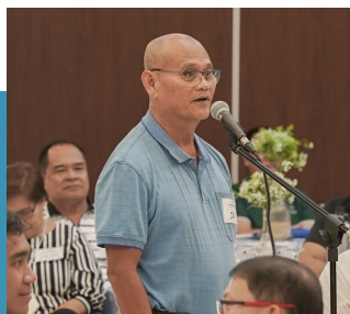
A stakeholder consults various specialists regarding his specific concerns in farming and opportunities for investment.

maintain optimal water quality, recycle nutrients, and reduce feed costs. Additionally, it allows aquafarmers to conserve water and feed inputs by using microorganisms to convert wastewater into a protein source.