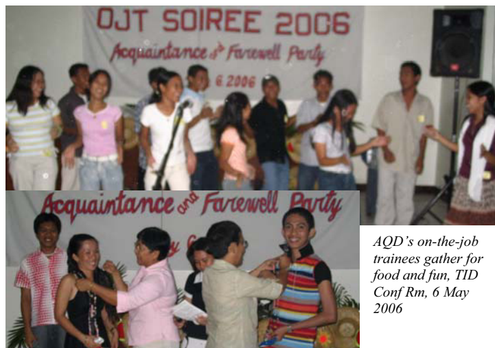
AQD's on-the-job trainees gather for food and fun, TID Conf Rm, 6 May 2006