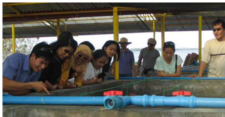
Training course in marine fish hatchery and nursery, 3 May –15 June 2006