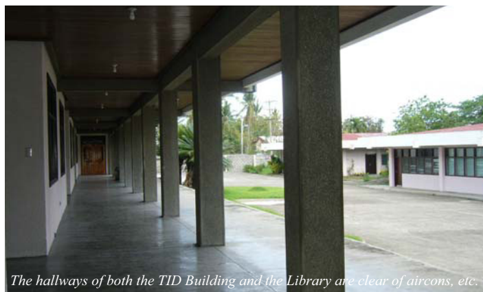
The hallways of both the TID Building and the Library are clear of aircons, etc.