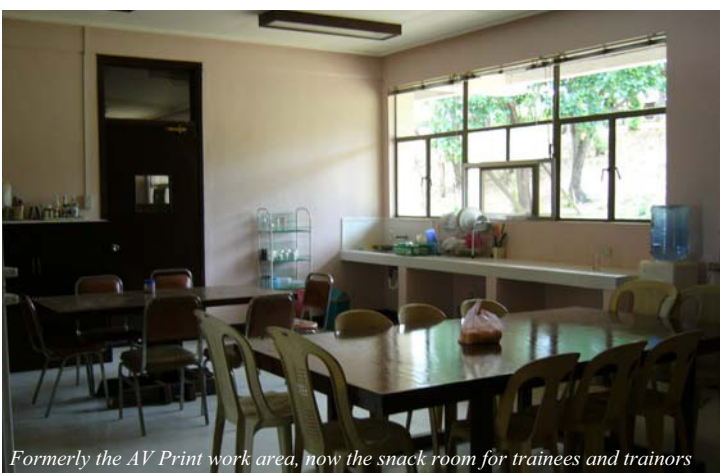
Formerly the AV Print work area, now the snack room for trainees and trainers