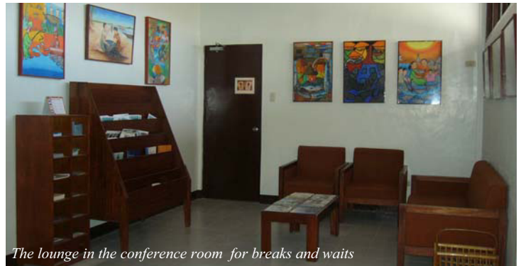
The lounge in the conference room for breaks and waits