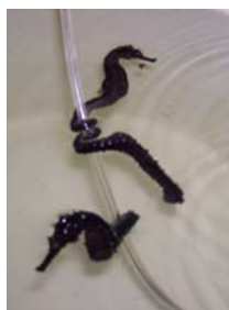
AQD's sea horse hatchery now has Hippocampus comes