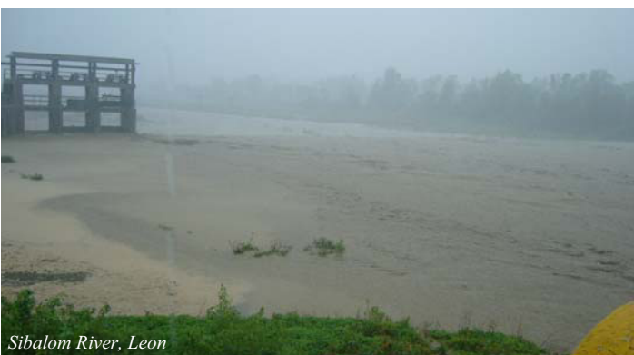
Sibalom River, Leon