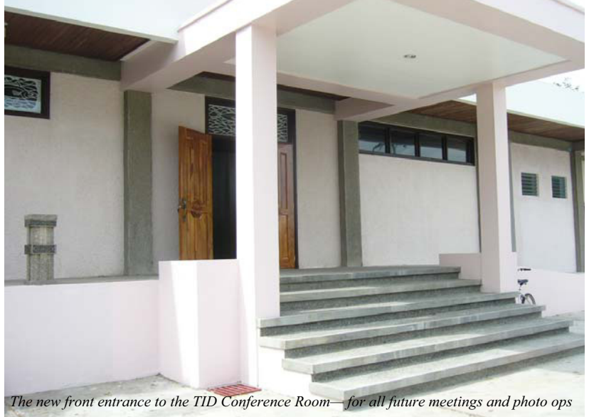
The new front entrance to the TID Conference Room—for all future meetings and photo ops