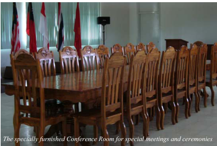
The specially furnished Conference Room for special meetings and ceremonies