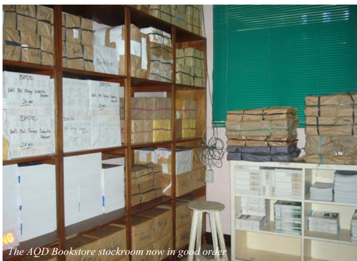
The AQD Bookstore stockroom now in good order