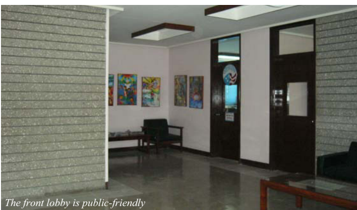
The front lobby is public-friendly

In 2003, AQD may have had the sparkling sophisticated Laboratory Facilities for Advanced Aquaculture Technologies, but 30 years of half-hearted maintenance had elsewhere taken a heavy toll. Roof leaks were a perennial problem. Walls needed repainting. Hatcheries had all kinds of makeshift structures. Debris was everywhere. At TID, offices were ‘lived in’ and closed-doors, work areas were sticky and heavily scratched, stockrooms were cockroach-infested and forgotten, aircons stuck out into hallways, walls had holes of all kinds and spatters of floor detergent and wax, cables and wires ran everywhere, and there was just the big conference room for lectures big and small. It was not lack of funds, but more like lack of responsibility for an undefined job.