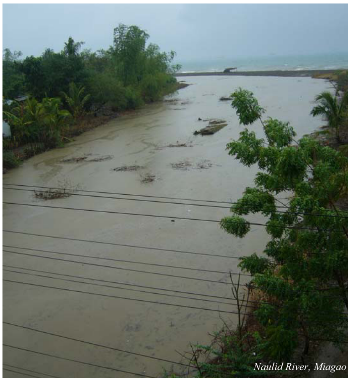
Naulid River, Miagao