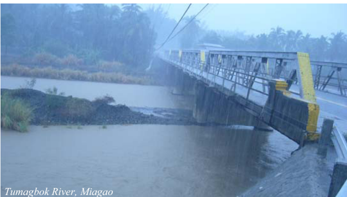
Tumagbok River, Miagao