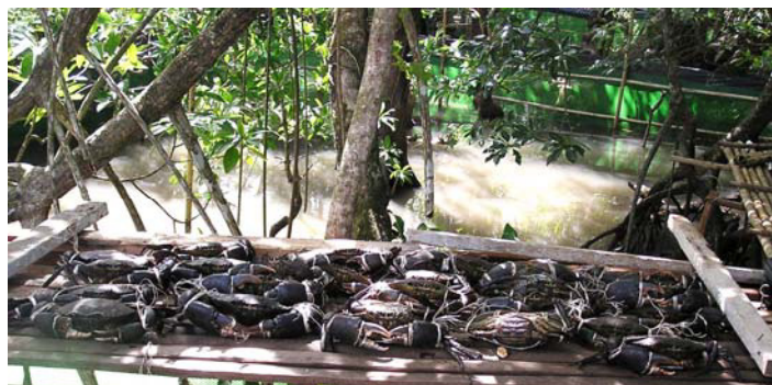
Mud crabs are of great interest to aquafarmers now