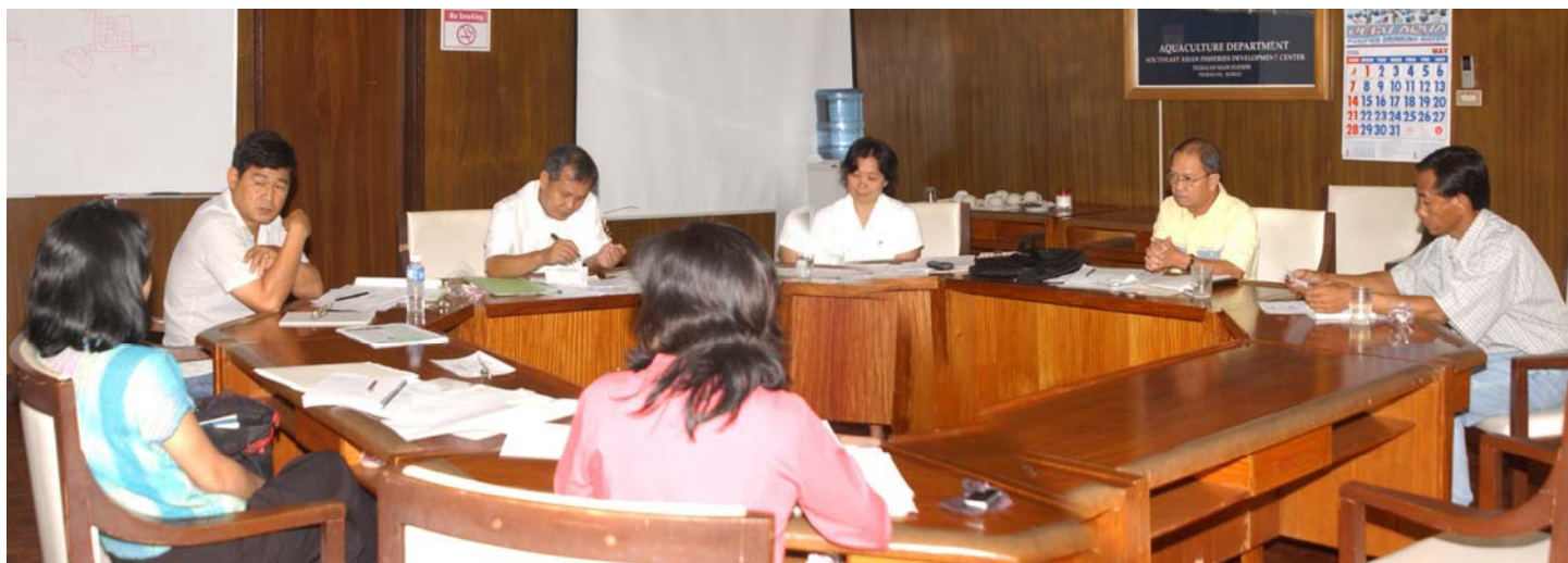
Management Committee Meeting, 26 May 2006