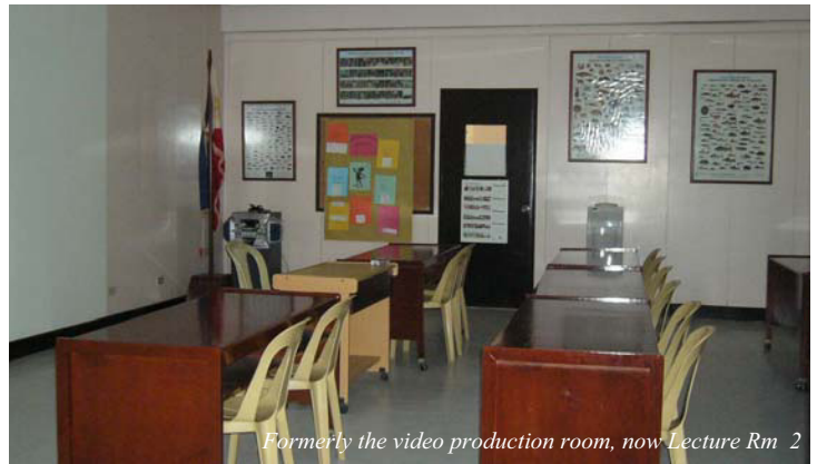
Formerly the video production room, now Lecture Rm 2