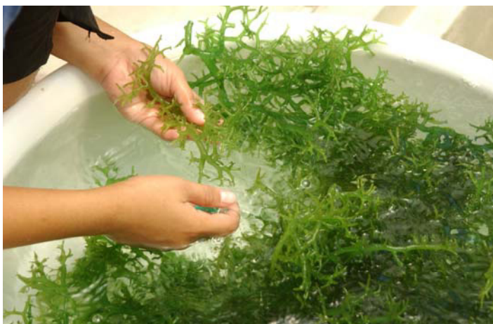
Although green-looking, Kappaphycus is a red seaweed and a carrageenophyte