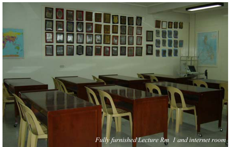
Fully furnished Lecture Rm 1 and internet room