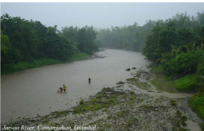
Jar-ao River, Camangahan, Guimbal