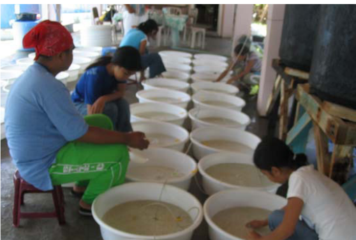
OJTs at their day jobs