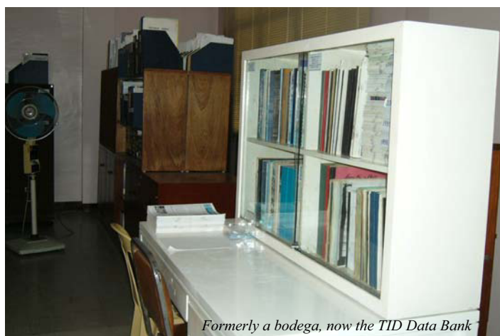
Formerly a bodega, now the TID Data Bank