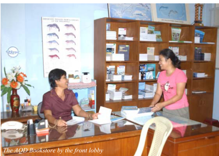
The AQD Bookstore by the front lobby