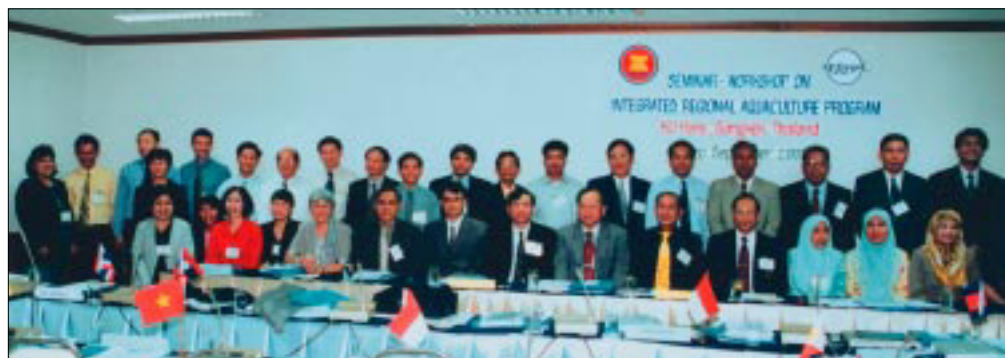
The meeting participants ►